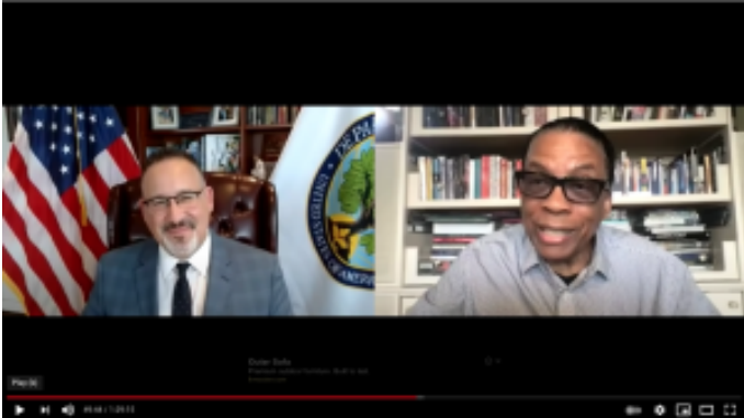
The webinar featured U.S. Secretary of Education Dr. Miguel Cardona and 14-time Grammy winner Herbie Hancock

2021 marked the 10 th time that the month of April was designated Jazz Appreciation Month. As part of that, the Herbie Hancock Institute of Jazz and the U.S. Department of Education organized a webinar and workshop to discuss jazz as an art form. Since the video of the webinar was posted on YouTube in late April, it has received more than 500,000 views.