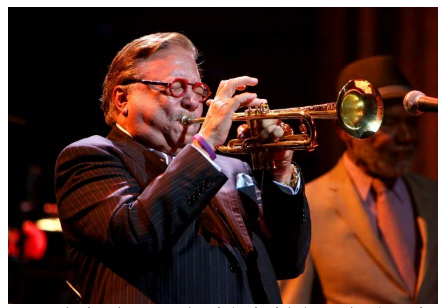
Arturo Sandoval & Hubert Laws Perform during the Thelonious Monk Institute Gala In accepting the award, Jones proclaimed himself as "the happiest man on the planet." Jones-ever the advocate urged those in attendance to continue supporting the arts and to push the envelope. "Can you imagine that we are one of the only countries without a minister of culture?" "Jazz is the heart and soul of music. It's at the center of everything I have ever done. We must push the boundaries to ensure that the arts remain a part of our daily lives. You cannot get an 'A' if you are afraid to get an 'F,' Jones said. "I humbly accept this honor on behalf of my fellow Jazz musicians past, present and future, and I promise that I will be right there with you on the front lines as we continue to work to preserve and promote our music, so that it will always get the recognition that it deserves."